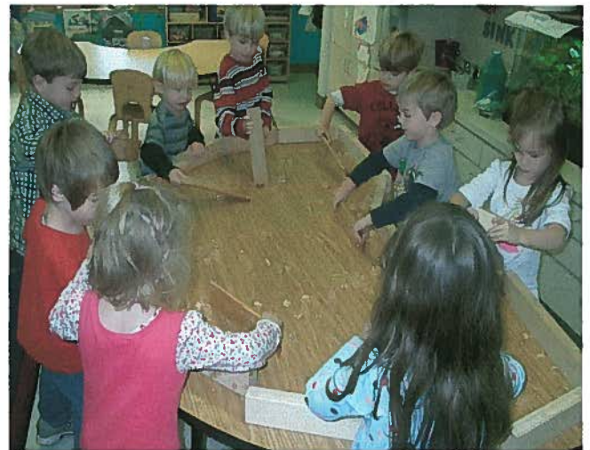
Pre K III children played ice hockey last month in a ice rink that they built themselves using blocks and ice cubes. This activity focused on notes concerning hand-eye coordination and the ability to hit a moving object.

Your teachers were able to have an extra special Christmas thanks to so many families and the Board of Directors who all gave extra during Christmas. Thank you for supporting those efforts and for helping your teachers have a Merry Christmas. This is one part of our teacher retention plan and it inevitably improves the overall quality of our program.