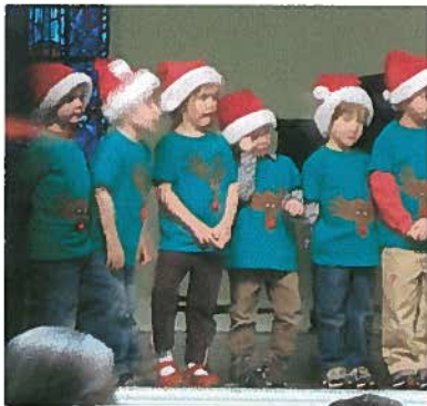
Pre K II and Pre K III performing at there annual Christmas program on December 15th